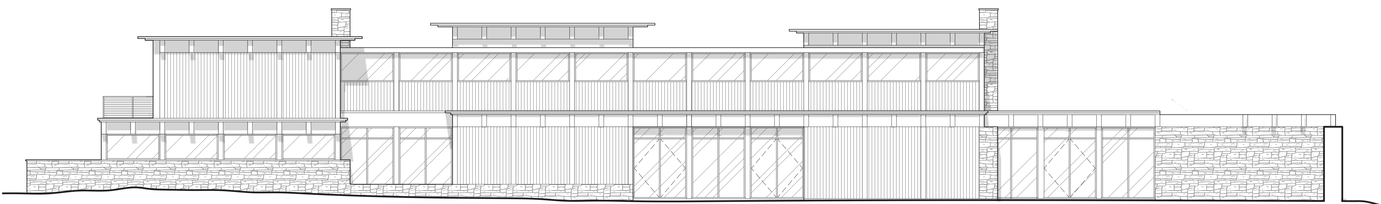
EAST ELEVATION SCALE: 1/8" = 1'-0"