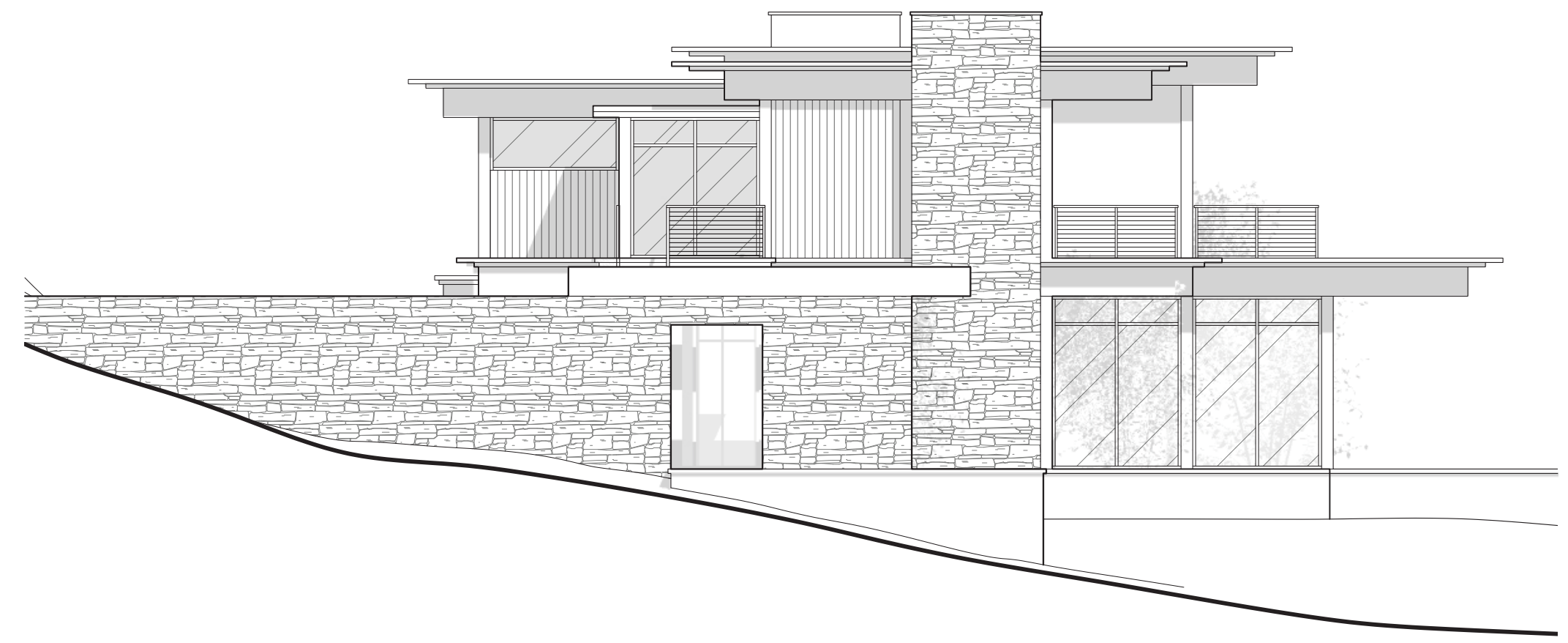
NORTH ELEVATION SCALE: 1/8" = 1'-0"