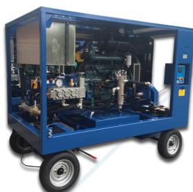
Site trailer option