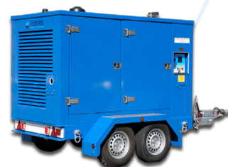
Road trailer option

Hughes Pumps Limited Highfield Works, Spring Gardens, West Sussex, RH20 3BS United Kingdom